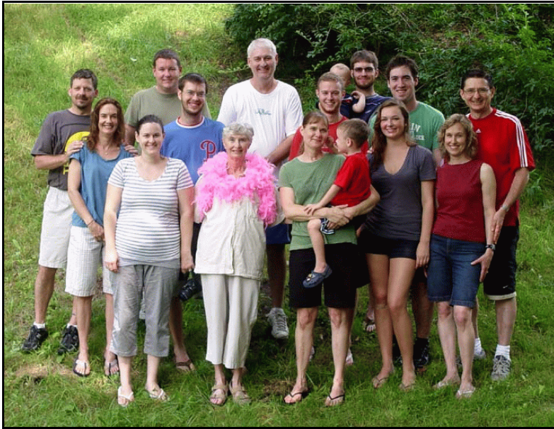
Our family reunion in July. See our web site for names.